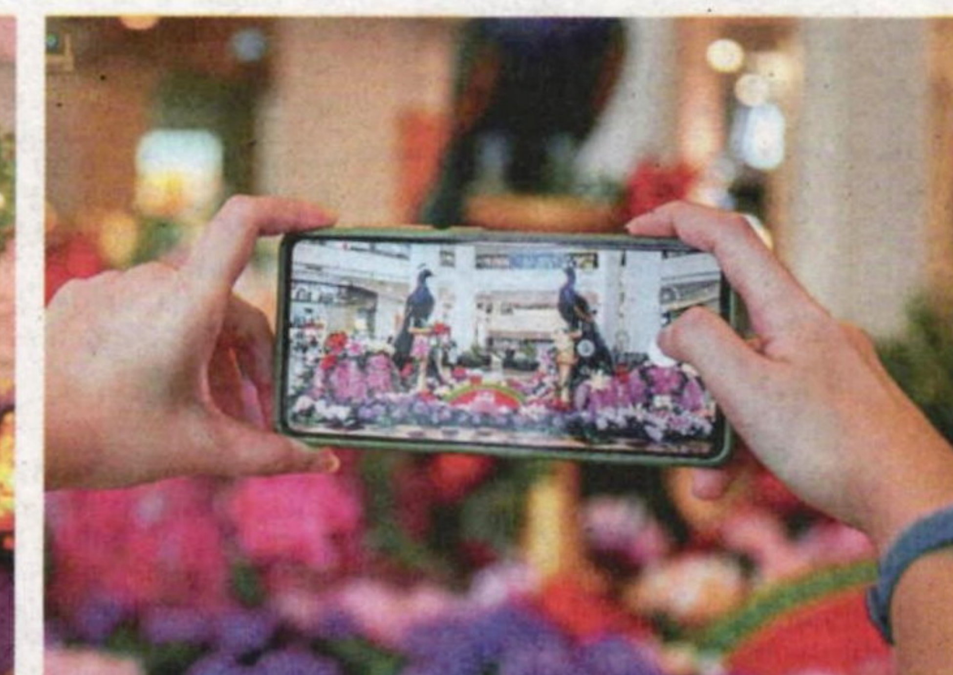
Two beautiful peacocks take centre stage in Berjaya Times Square Kuala Lumpur this Deepavali.

(Left) Shoppers to Sunway Velocity can scan the QR code at the kolam to trigger a AR dance video by AR character Meera.