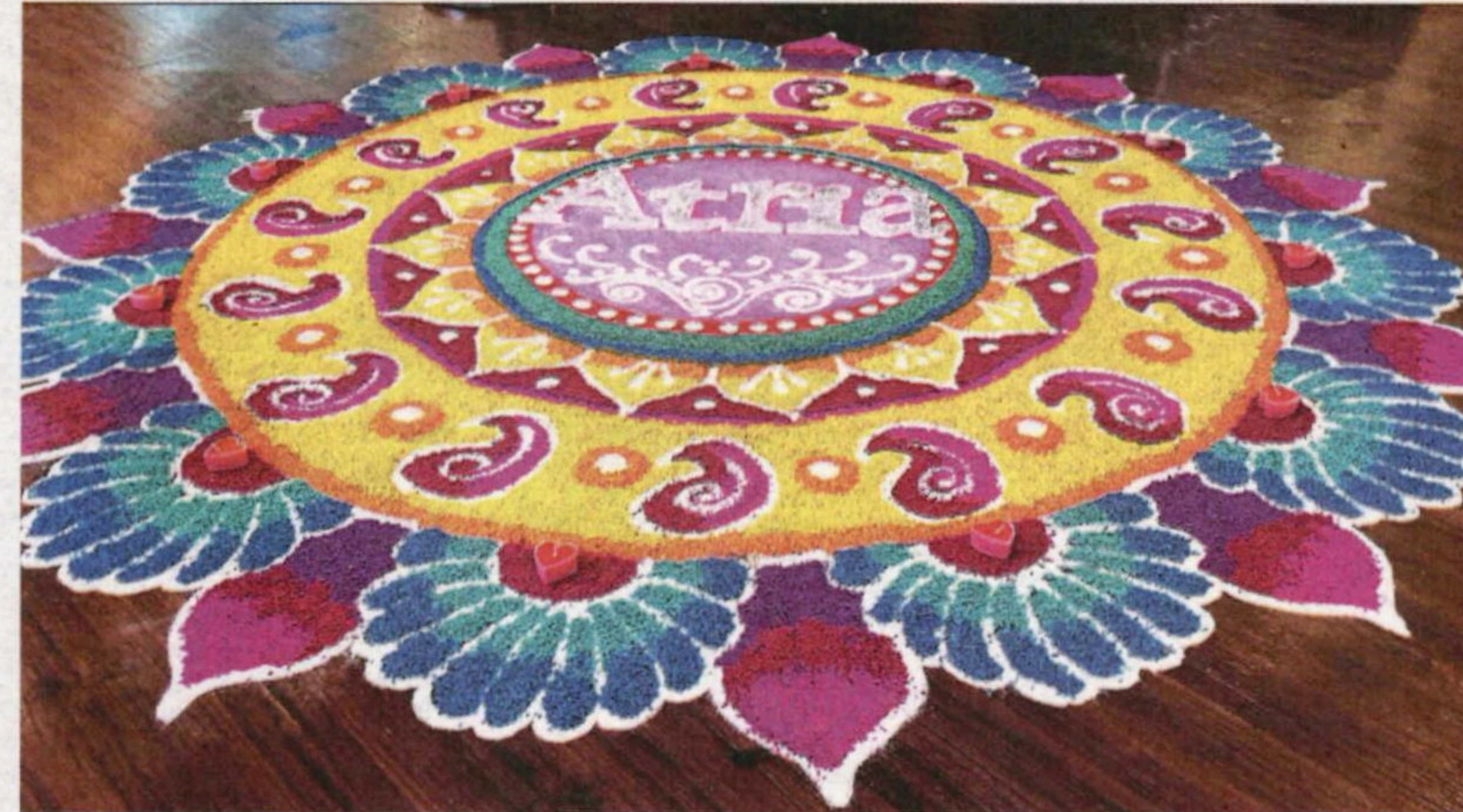
Atria shopping centre's kolam display of yellow, red and pink with candles on the edges.