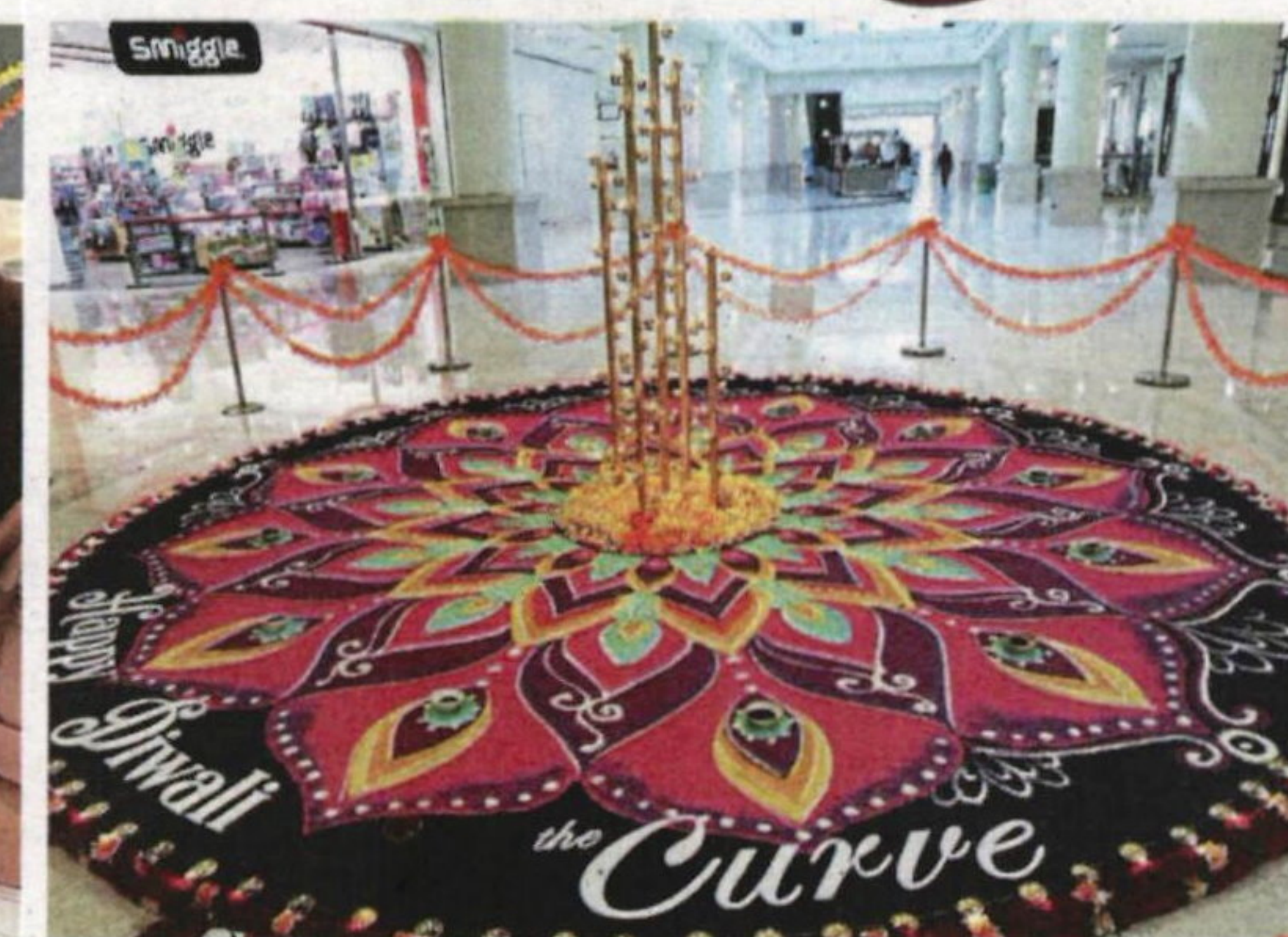
The Curve's kolam in purple, fuchsia, yellow and turquoise with lamps in the middle.

(Left) Shoppers to Sunway Velocity can scan the QR code at the kolam to trigger a AR dance video by AR character Meera.