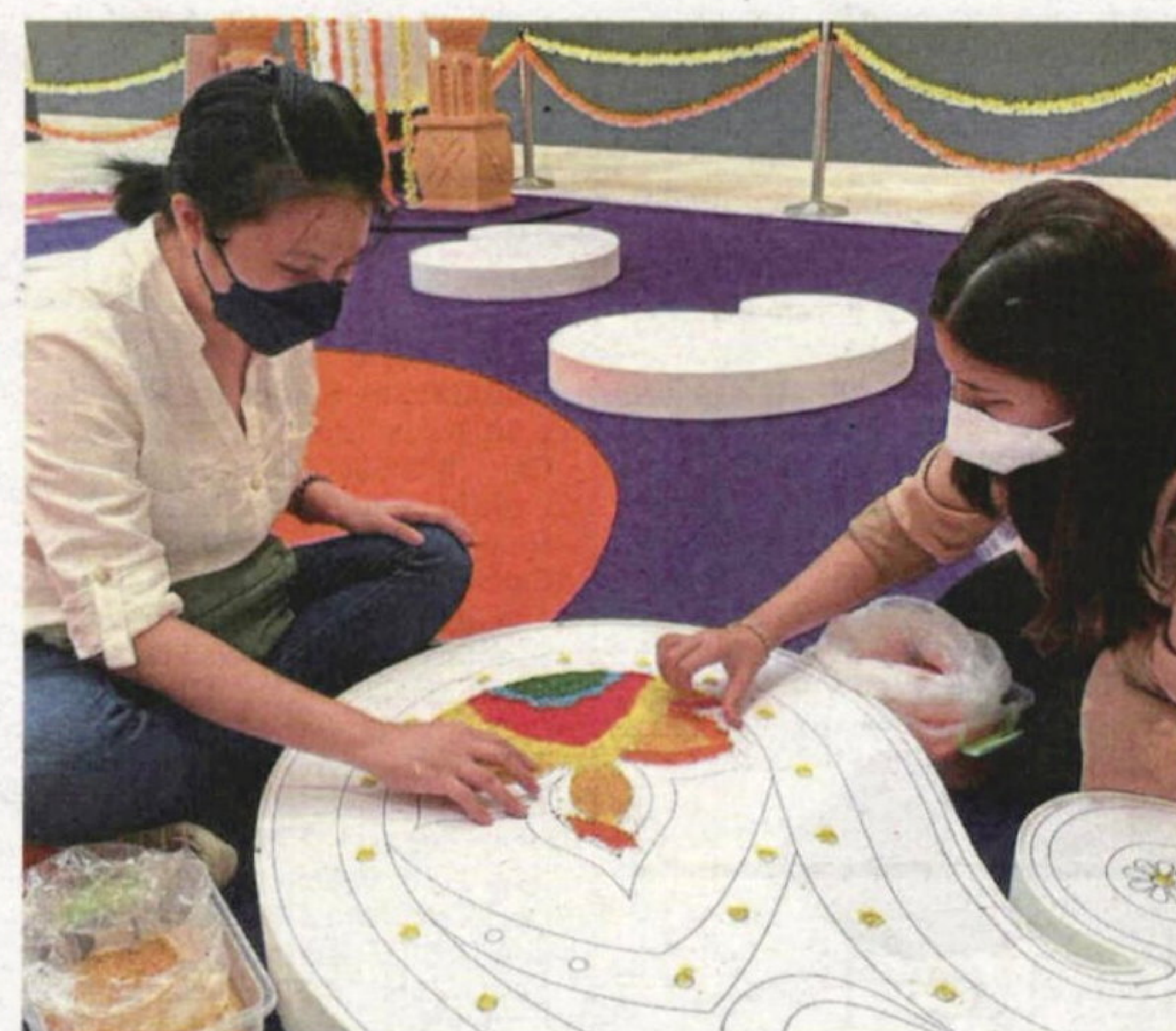
Shoppers at Setia City Mall can create their own rangoli designs.

In Mytown Kuala Lumpur, a 6m-tall peacock stands proudly at Central Town along with a dazzling kolam .