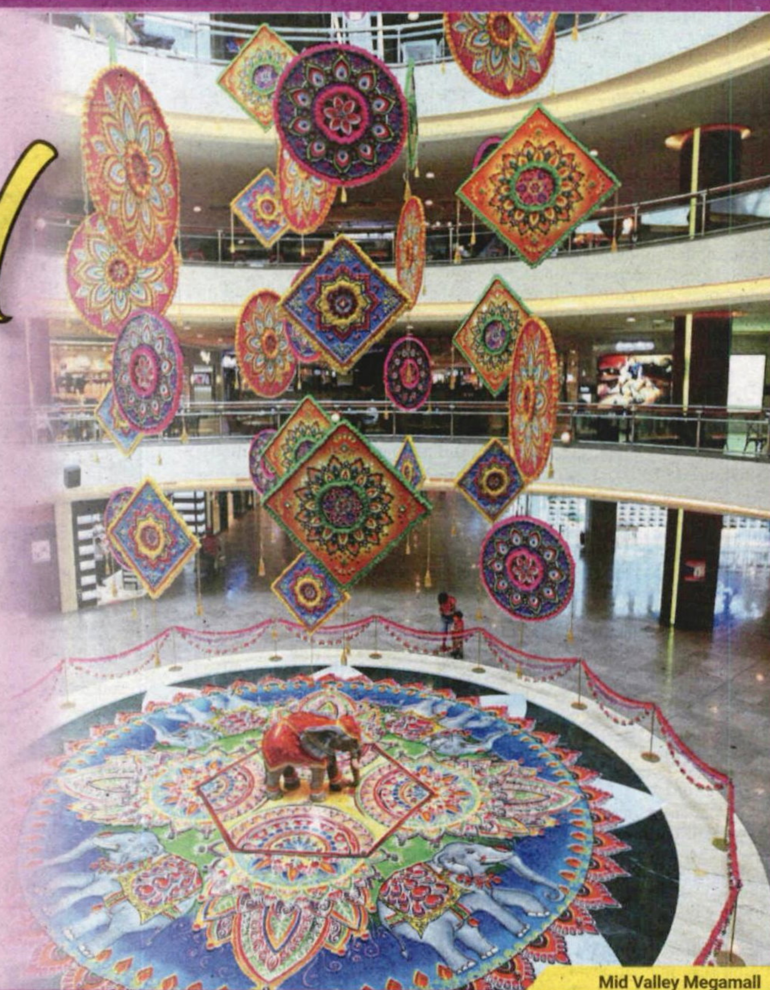
Mid Valley Megamall