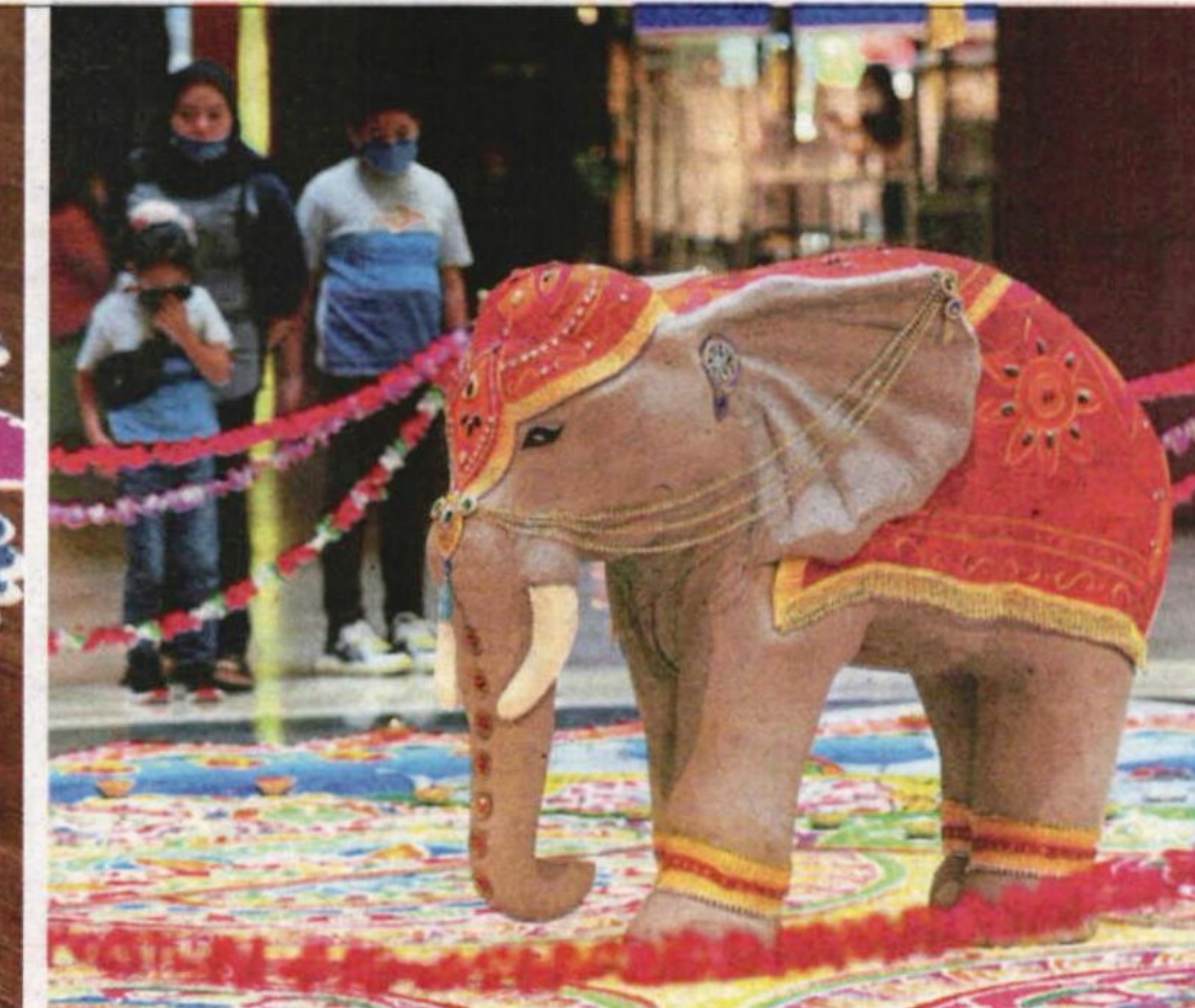
Mid Valley Megamall features bright gradients, intricate patterns and elephant motifs in its decorations.