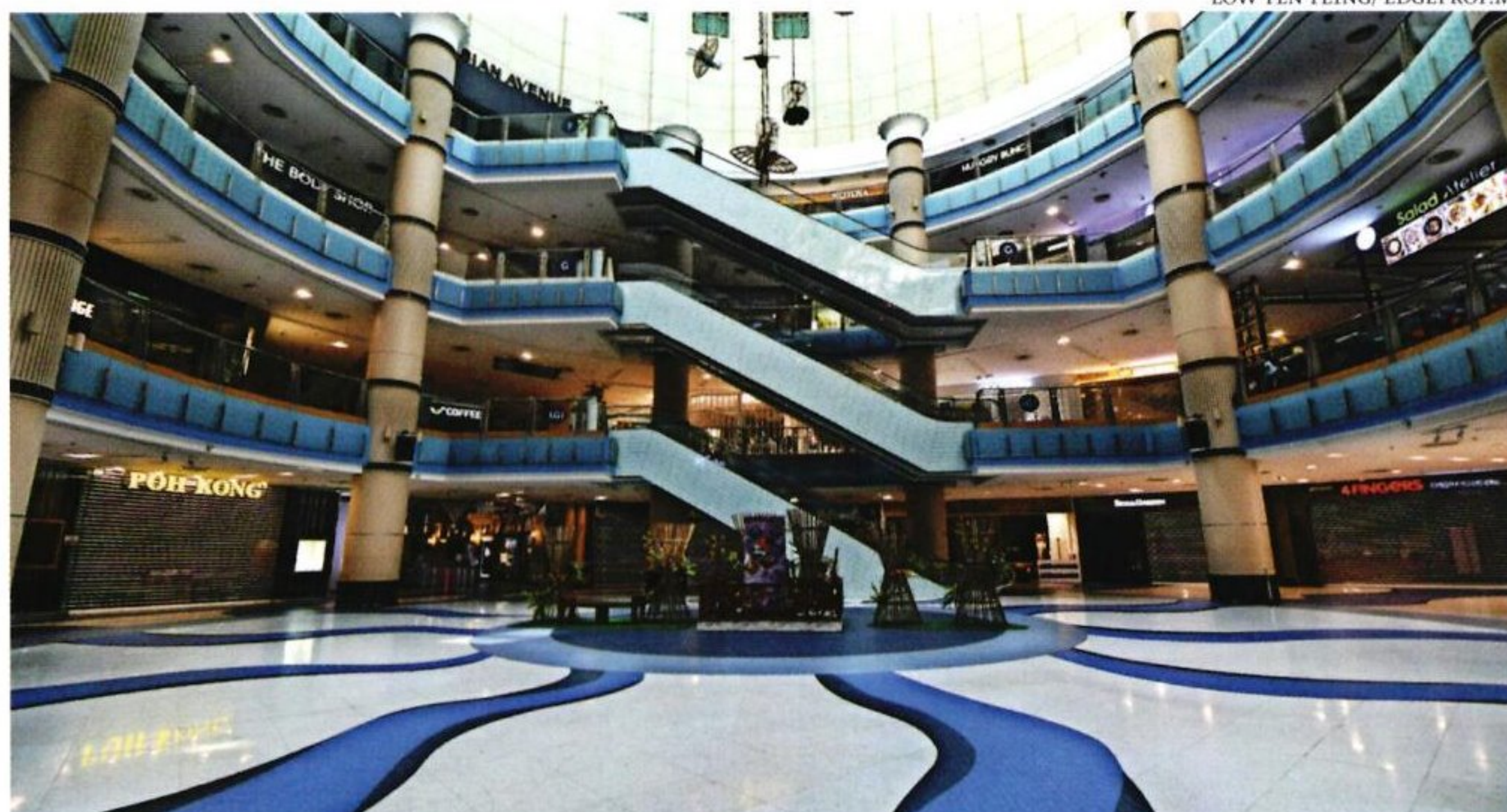
REITs expected to be negatively impacted by Covid-19 are those in the retail and hospitality sectors

"In this low interest rate environment, M-REITs still command attractive yields compared with fixed income instruments. In the short run, office REITs are less impacted by the Covid-19 outbreak, but in the long run, we continue to prefer the retail