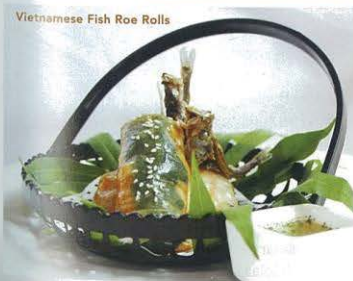
Vietnamese Fish Roe Rolls