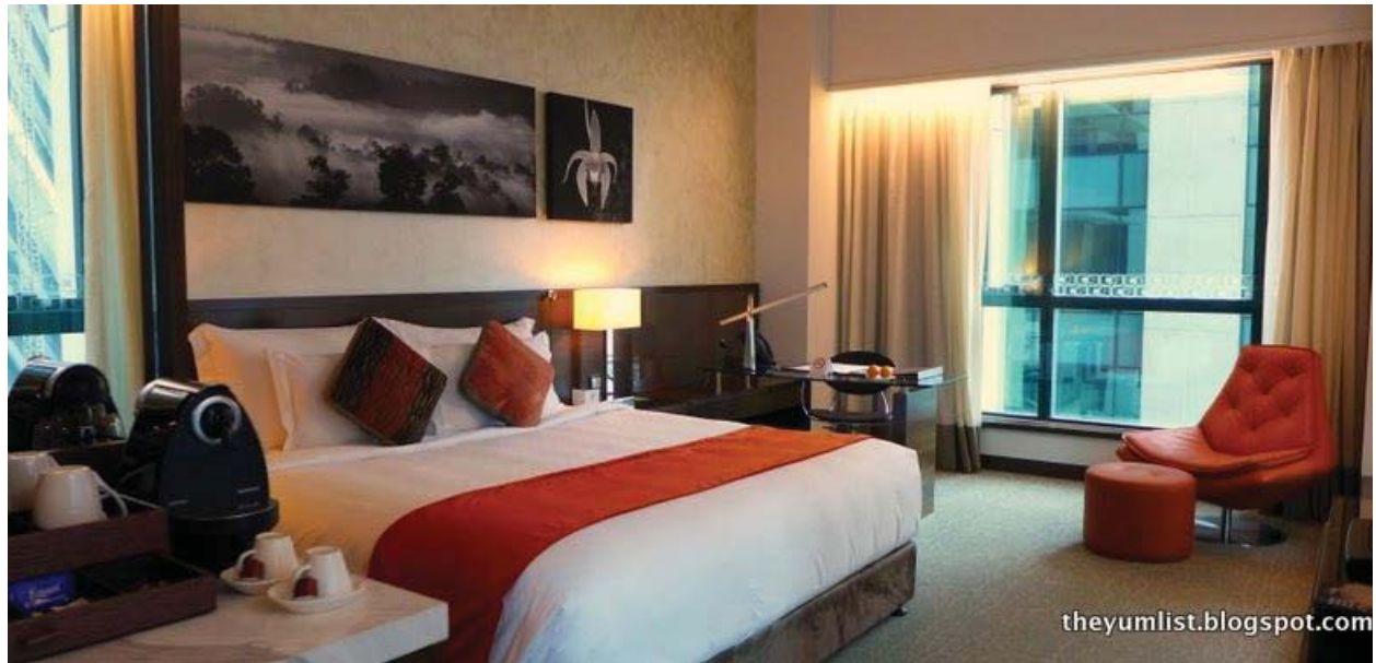
Premier Deluxe King Room

Headline: GTower Hotel, Kuala Lumpur Publication: The Yum List ( http://theyumlist.blogspot.com/2015/03/gtower-hotel-kuala-lumpur.html ) Date of Publication: March 16, 2015 Section heading: - Page number: - Byline / Author: By Monica Tindall Outlet featured: GTower Hotel