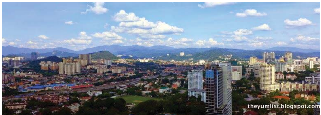
View from Rooftop Bars