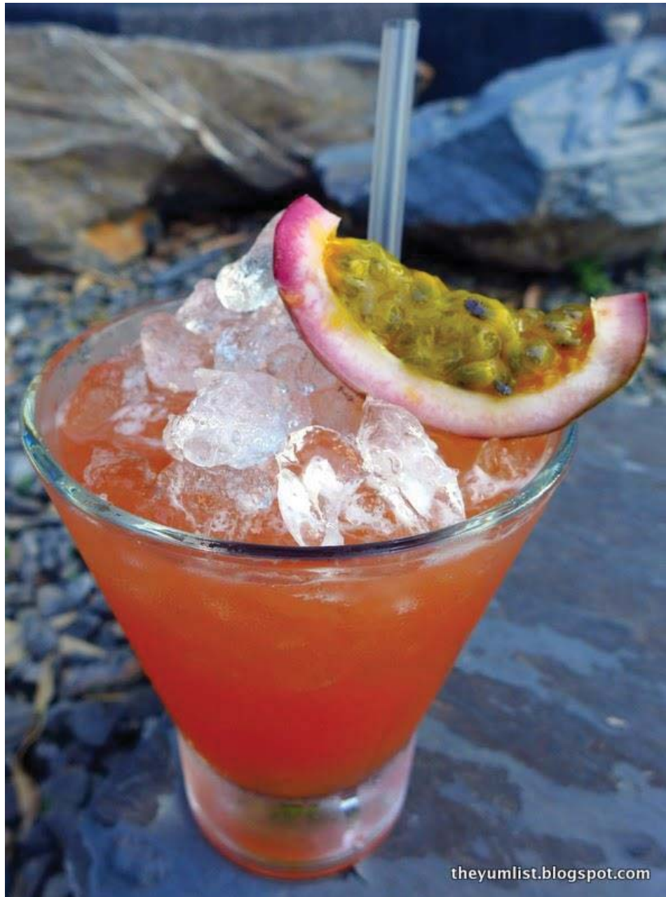
Excellent Cocktails at View Rooftop Bar

Headline: GTower Hotel, Kuala Lumpur Publication: The Yum List ( http://theyumlist.blogspot.com/2015/03/gtower-hotel-kuala-lumpur.html ) Date of Publication: March 16, 2015 Section heading: - Page number: - Byline / Author: By Monica Tindall Outlet featured: GTower Hotel