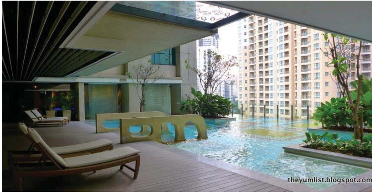
11th Floor Pool

Headline: GTower Hotel, Kuala Lumpur Publication: The Yum List ( http://theyumlist.blogspot.com/2015/03/gtower-hotel-kuala-lumpur.html ) Date of Publication: March 16, 2015 Section heading: - Page number: - Byline / Author: By Monica Tindall Outlet featured: GTower Hotel