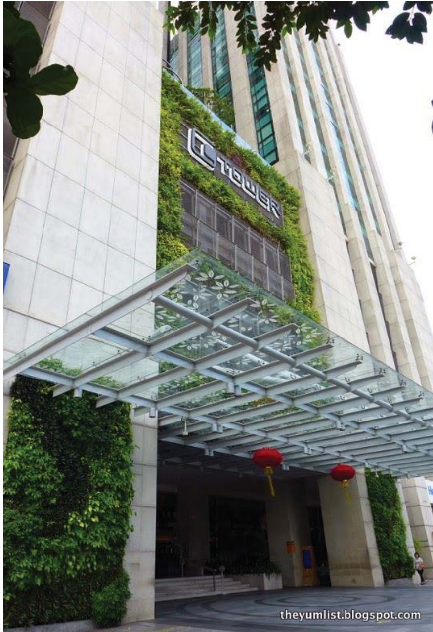
G Tower Hotel, Kuala Lumpur