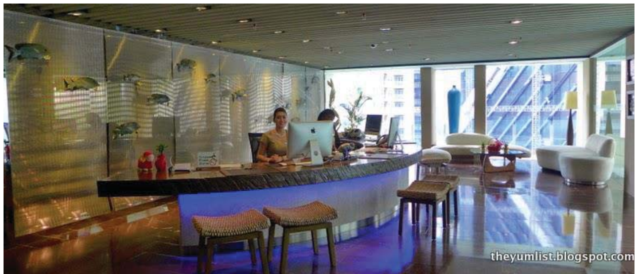
GTower Hotel Reception

Located on busy Jalan Tun Razak, the hotel is less than a five-minute walk to the nearest LRT station, two blocks away from the KLCC park, and multiple office towers and tourist attractions are easily accessed from its doorstep. For those with cars, onsite parking is available, equipped with a feature we wish other buildings would duplicate: carbon monoxide (CO) sensors in the basement lots monitor CO levels, automatically forcing fresh air in if unhealthy CO levels are reached. Which brings us to a whole host of other earth-friendly routines the property practices.