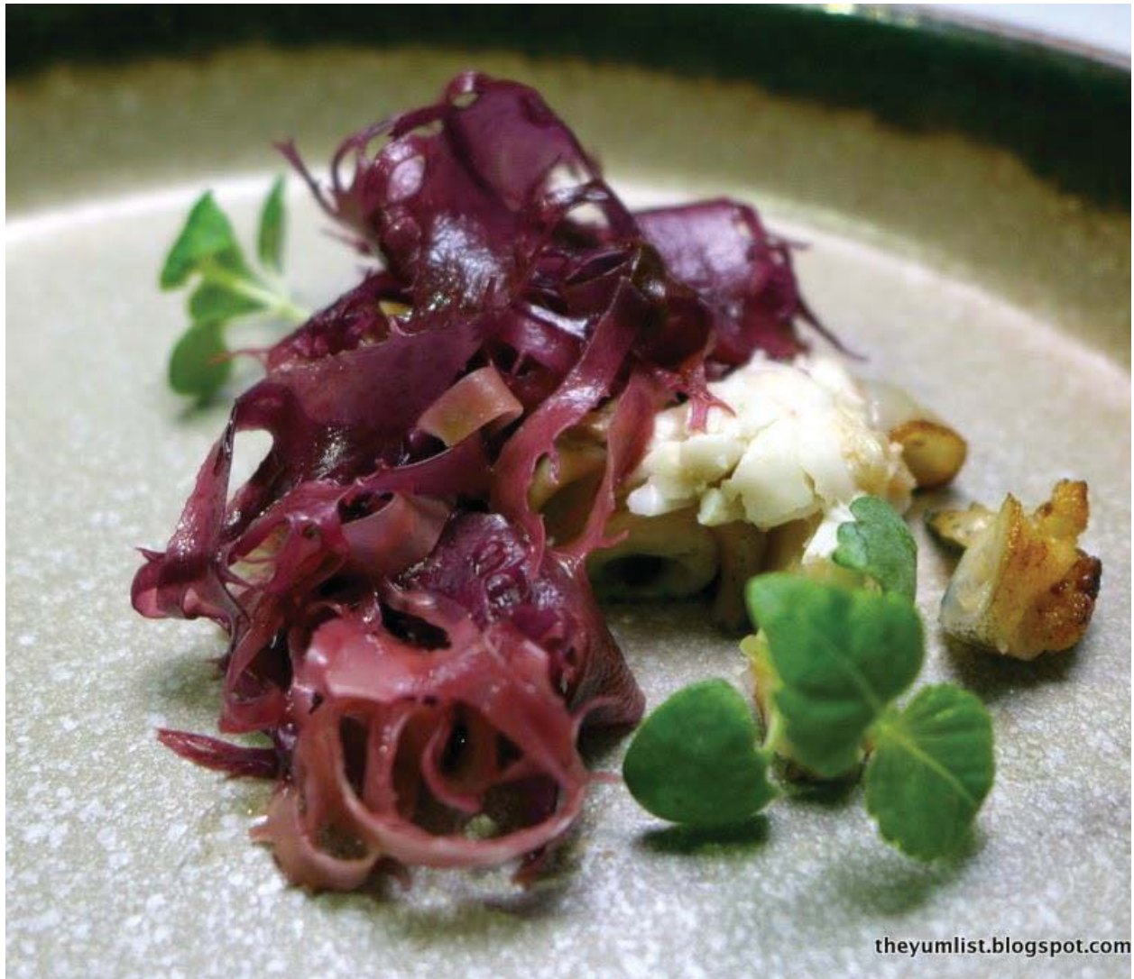
Fine Dining on the Upper Deck

Headline: GTower Hotel, Kuala Lumpur Publication: The Yum List ( http://theyumlist.blogspot.com/2015/03/gtower-hotel-kuala-lumpur.html ) Date of Publication: March 16, 2015 Section heading: - Page number: - Byline / Author: By Monica Tindall Outlet featured: GTower Hotel