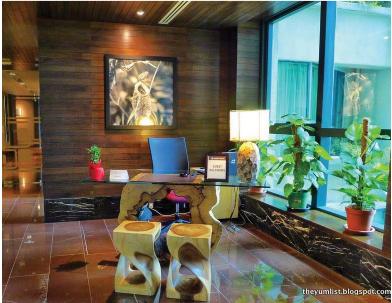
Guest Relations Desk

Headline: GTower Hotel, Kuala Lumpur Publication: The Yum List ( http://theyumlist.blogspot.com/2015/03/gtower-hotel-kuala-lumpur.html ) Date of Publication: March 16, 2015 Section heading: - Page number: - Byline / Author: By Monica Tindall Outlet featured: GTower Hotel