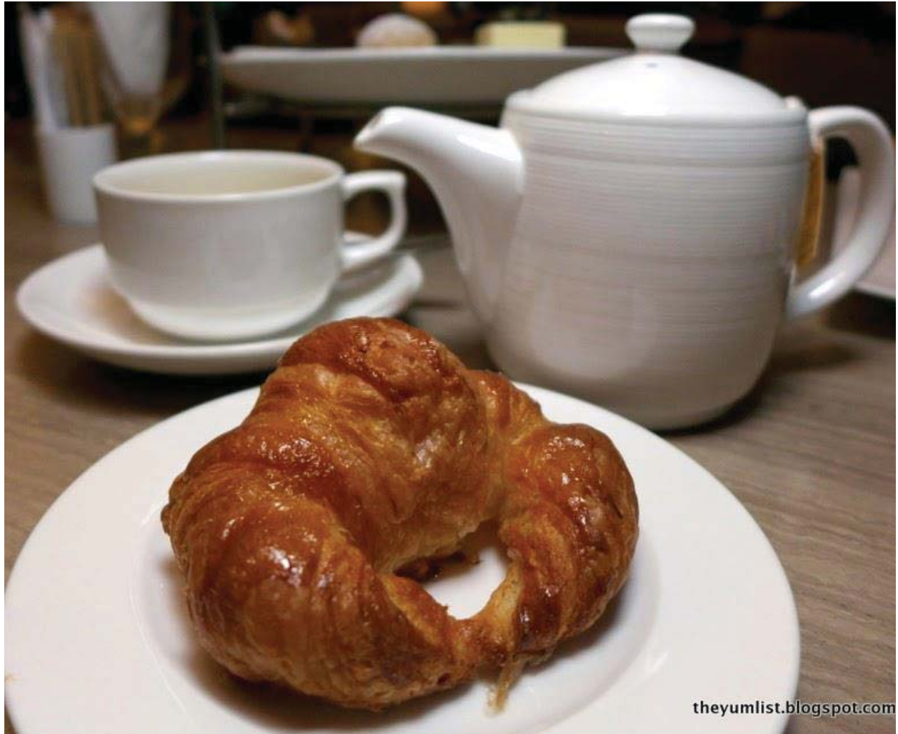
Bread Lounge - Croissants are popular items

Headline: GTower Hotel, Kuala Lumpur Publication: The Yum List ( http://theyumlist.blogspot.com/2015/03/gtower-hotel-kuala-lumpur.html ) Date of Publication: March 16, 2015 Section heading: - Page number: - Byline / Author: By Monica Tindall Outlet featured: GTower Hotel